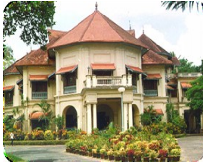
Biomedical Technology Wing

A team of scientists, engineers and supporting staff work here in multidisciplinary areas, ranging from biomaterials development to medical device development and technology transfer.