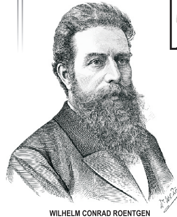
WILHELM CONRAD ROENTGEN